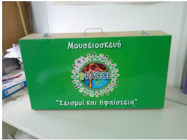
A preview of the Greek Educational Kit (Suitcase)

The Mobile Educational Suitcase is one of the most important deliverables of RACCE . The experiential Educational Project is designed to be connected with school curricula and it will be addressed to children, aiming to palliate the emotional burden and help them cope in case of a serious seismic hazard, by raising awareness and improving their knowledge on earthquake and volcanic disasters.