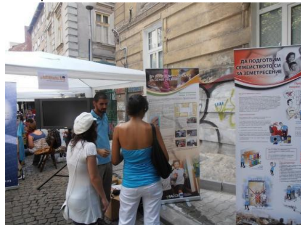
On September 12th, the exhibition moved to the National Polytechnical Museum and was first

to teachers, students and parents on how to prepare their class and how to prepare their family to meet disaster; and how to provide psychological support to children who were affected by the earthquake.