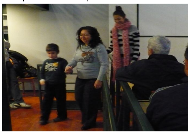
After an earthquake simulation, children guide their own parents outside the simulator, while the adults keep their eyes closed.