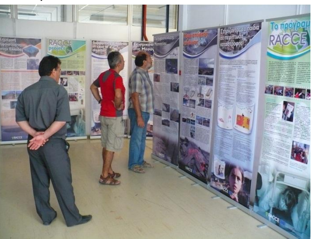
A preview of the installation of the Exhibition

The realisation of a Travelling Exhibition aims to serve information and dissemination purposes, which will include about 20 posters and static displays related to seismic and volcanic hazards and coping of unexpected emotions, with emphasis to the situation of each participating country.