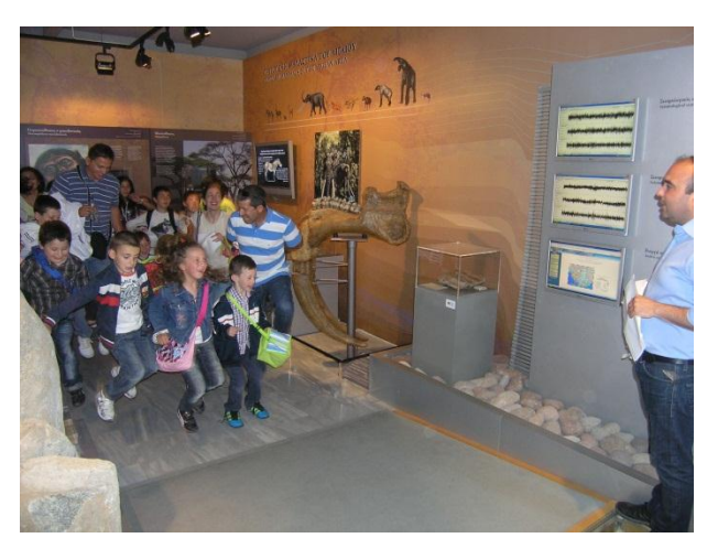
Schoolchildren with their teachers having fun, while creating their own micro earthquake, at the Natural History Museum of the Lesvos Petrified Forest, during the educational program: I study earthquakes - I learn how to be protected

the seismological station at Sigri and study the Museum's interactive map of active seismicity in Greece. Participants at the events were also involved in empirical activities, including the implementation of protection measures during an earthquake, at the Museum's earthquake table, which simulates large earthquakes that have occurred in Greece and worldwide. Finally, the visitors had the opportunity to discuss with the scientific staff of the Museum on earthquake prevention and protection measures. The activities helped the public, and mainly children, to understand the earthquake phenomenon and to realise that the prevention of catastrophic effects comes with knowledge of the appropriate behaviour before, during and after an earthquake. The activities have been published on the website of the Disaster Reduction Community "Prevention Web"