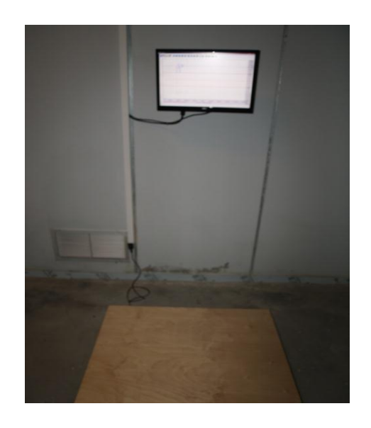
"Make your quake