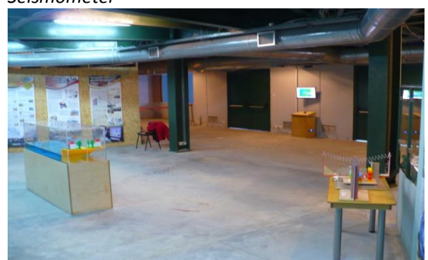
RACCE temporary exhibition