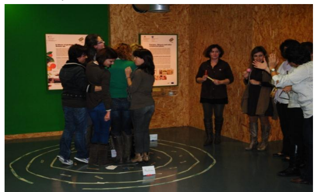
Identifying earth's internal from the second day of the workshop in NHMC

The workshop was realized at the exhibition hall of the NHMC. The first day, 24<sup>th</sup> of November 2012, was common for all Education Levels since it was referring to the Theoretical background of the program. The next three days were divided in the three Educational Levels, Preschool, Primary and Secondary.