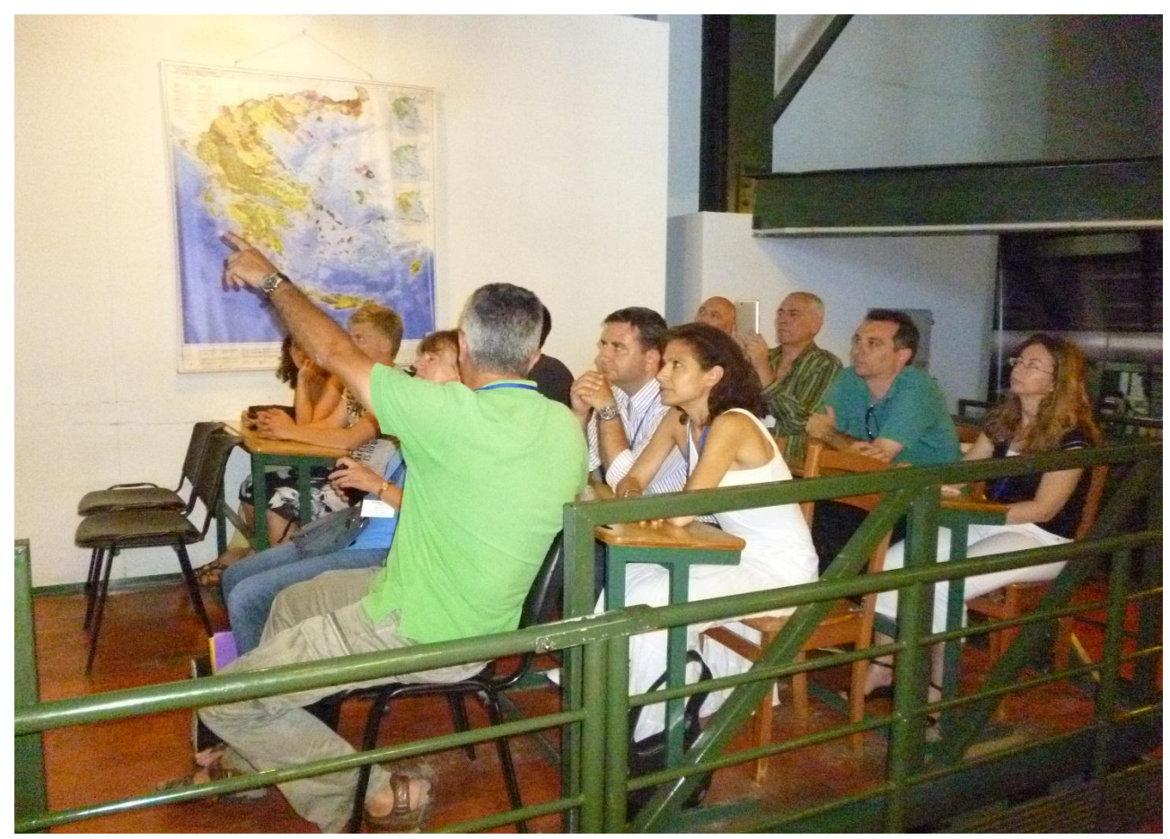
During the fourth meeting at the seismic simulator of the Natural Museum of Crete.

According to the evaluation, meeting achieved all its goals and its main results can be summarized as follows: