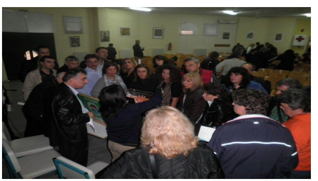
Workshops for Emergency Planning to local civil protection authorities:

In the framework of EPPO's project "Seismic Risk Management at Schools", almost 750 Directors of elementary and secondary schools have been informed about RACCE project and its activities (a. Lesvos island, 3-4/10/12, 130 teachers b. Kos island, 12/10/12, 65 teachers c. Rethymno Crete, 5/11/12, 120 teachers d. Thessaloniki, 29-30/11/12, 300 teachers e. Kilkis, 17/12/2012, 150 teachers).