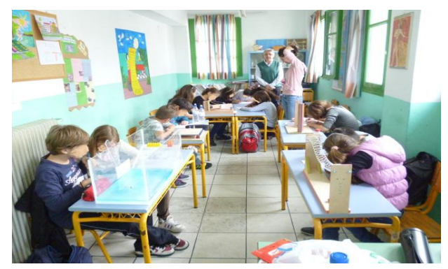
During the implementation of the educational activities in the classroom

• On November 24,26,27 and 28<sup>th</sup> of 2012, almost 120 teachers of Primary and Secondary Level as well from the Preschool Education participated in the "Workshop and presentation of educational activities program "RACCE" for the psychological support for children in case of an earthquake or volcanic risk.", that was implemented for each educational level on a different approach.